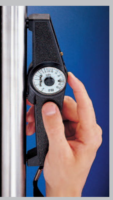
Stable design with additional tail-end support. No annoying rocking during measurement.