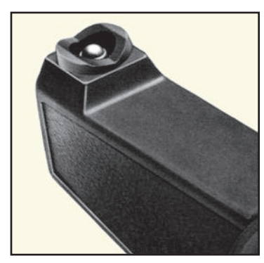
Carbide measuring probe for long life.