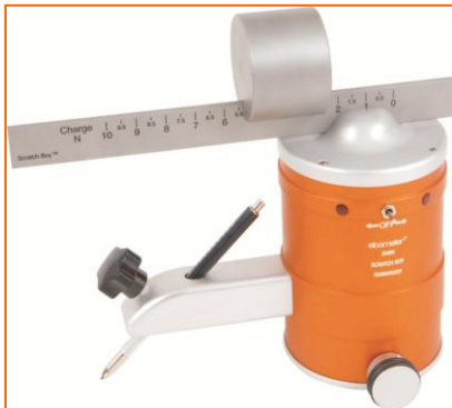
Elcometer 3086 Motorised Pencil Hardness Tester